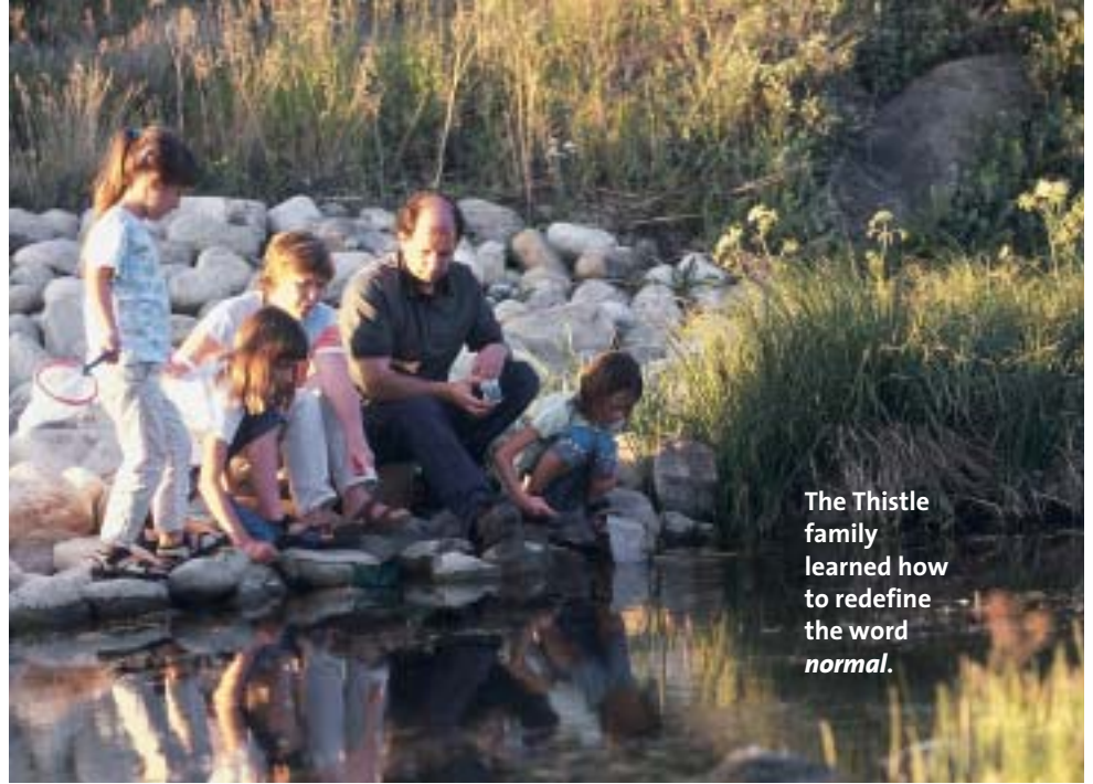
The Thistle family learned how to redefine the word normal .

Household chores were another area that needed adjusting. When I worked from home it was easier to just